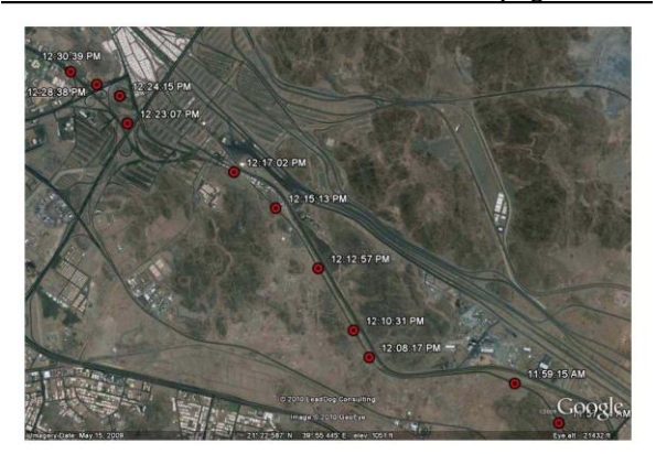
Figure 2. Tracking of Pilgrims in the Holy area

The developed system was tested on the Holy sites. A master unit and three mobile units were used. The three units were carried by three pilgrims whose movement was restricted to a 50 meter radius from the master unit. The master unit was moved throughout the Holy area to simulate a fixed network spread throughout the area. The <sup>[6]</sup> mobile units sent their location information periodically to the master unit who sent this information to the server. Figure 2 shows the tracking of the movements of one pilgrim throughout a route that is usually used by pilgrims during Hajj season. It is interesting to see how the system was able to record the exact locations of the pilgrim.